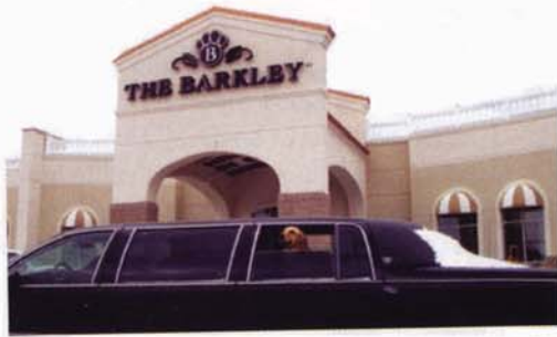
above: LIMO SERVICE IS AVAILABLE FOR YOUR PET WITH DOOR-TO-DOOR SERVICE.