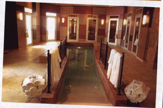
right: SPAAH TIME FOR PETS — JUST A SAMPLING OF THE LUXURY AT THE BARKLEY IN CLEVELAND.

The Barkley staff is prepared for this sort of thing.