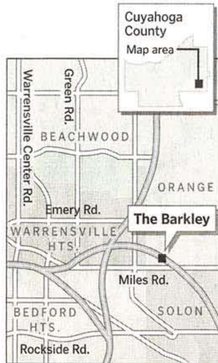
THE PLAIN DEALER