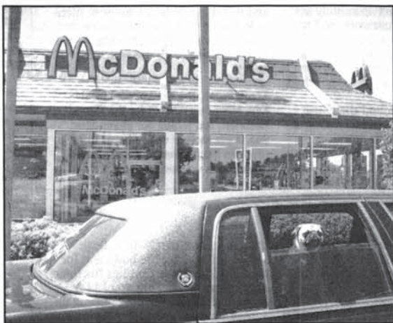
A dog being treated by the spa gets a car ride through town.