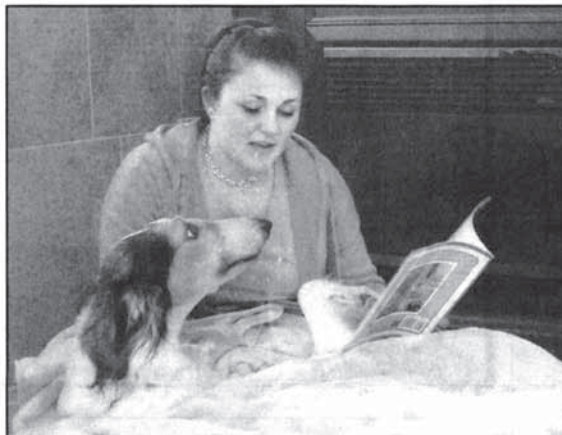
A dog is read to by a spa worker as part of its relaxing day at the spa.